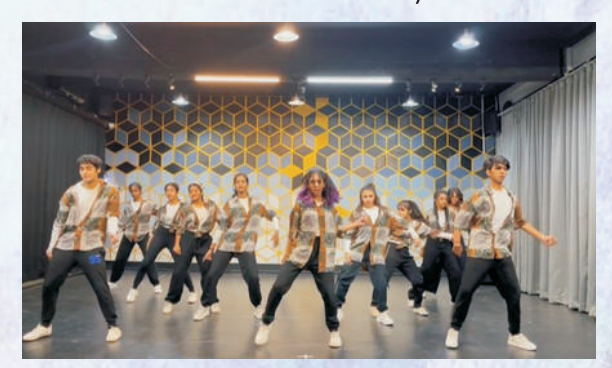
Street Dance Event