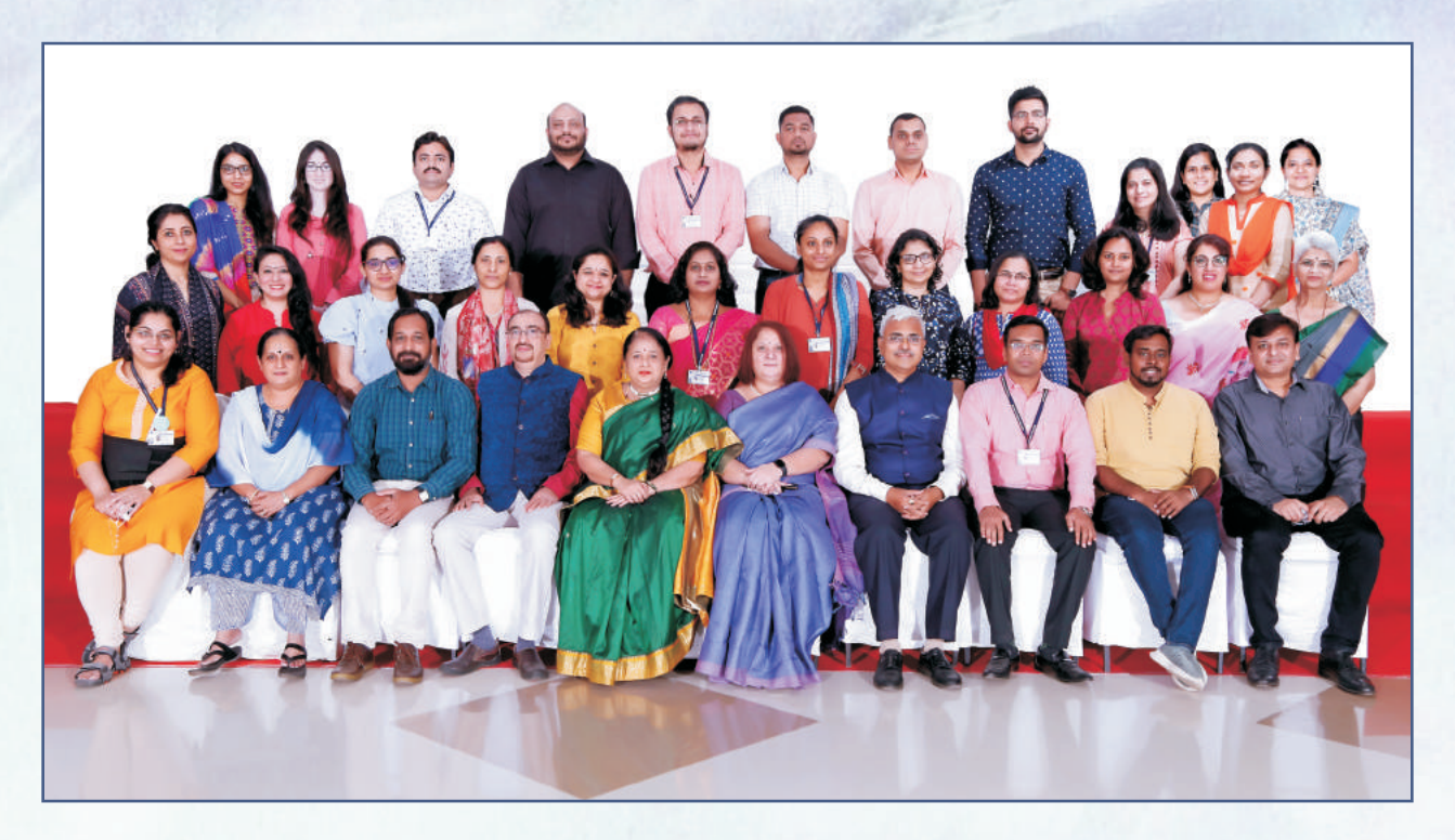
Degree College Arts Faculty