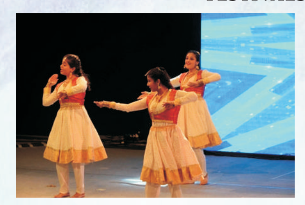
Classical Dance at 60th Annual Day