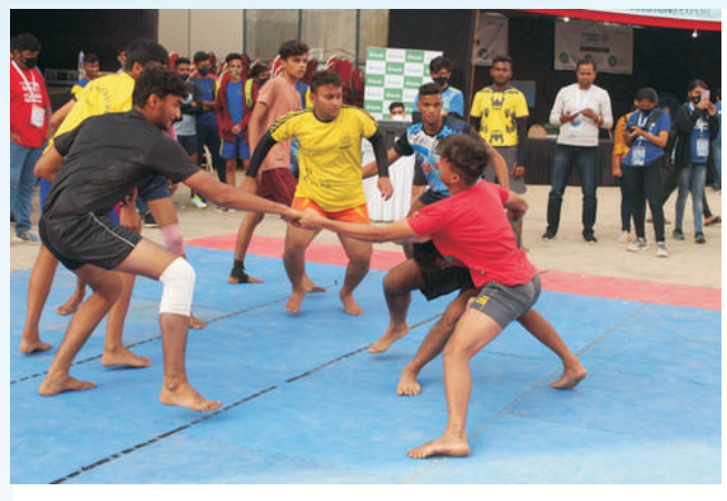
Participants engrossed in a game of Kabaddi