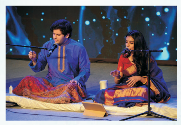
Classical Music Performance at 60th Annual Day