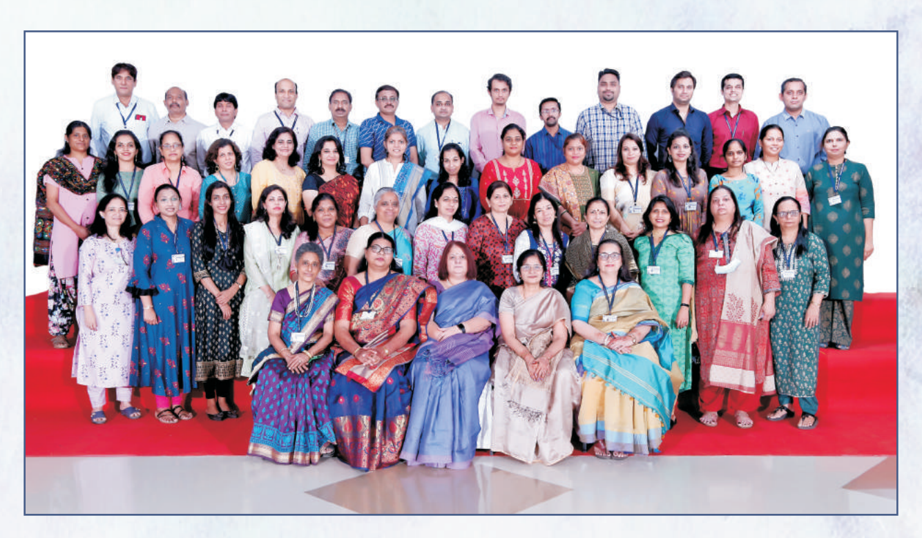
Junior College Science Faculty