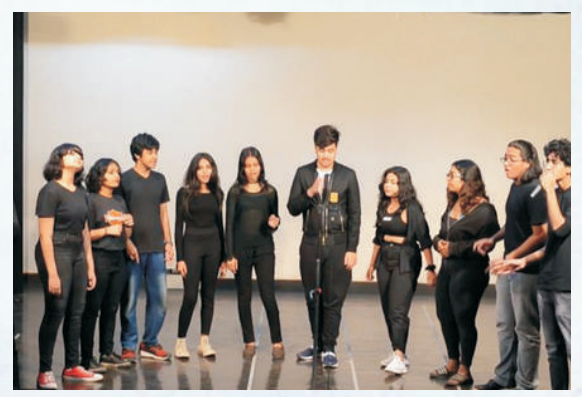
1st Place in Western Acapella event of IIT Bombay Mood Indigo festival