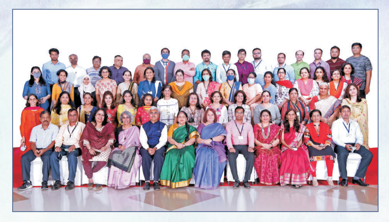
Degree College Science Faculty