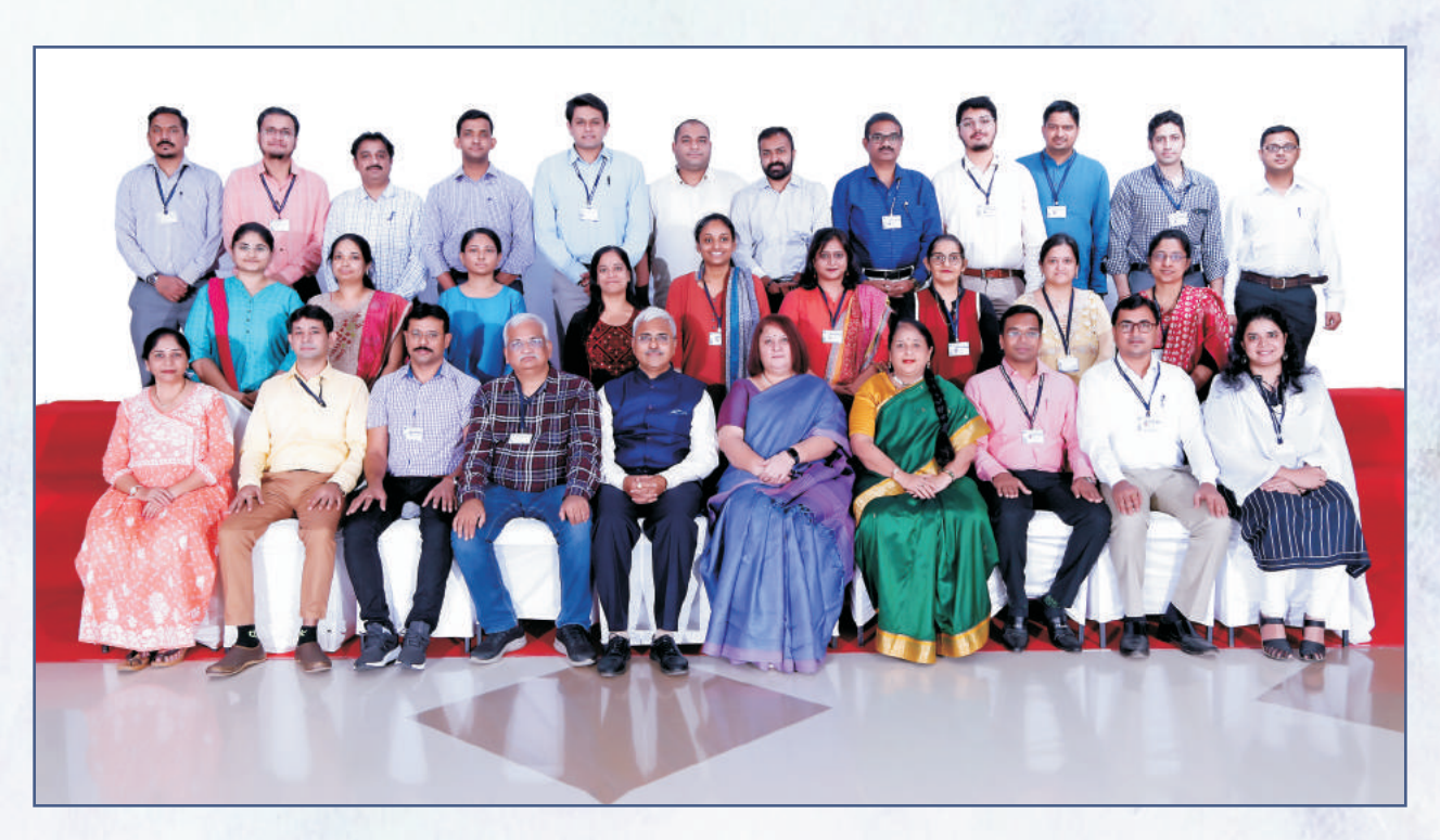
Degree College Commerce Faculty