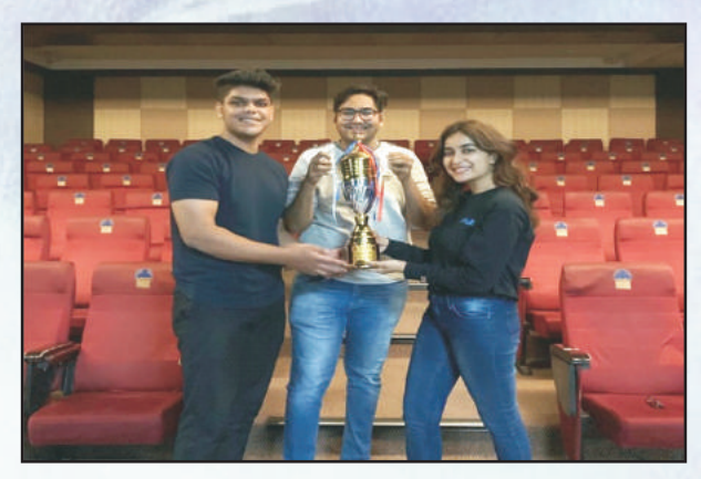
Overall Runners up Championship at Malhar festival of St Xaviers College