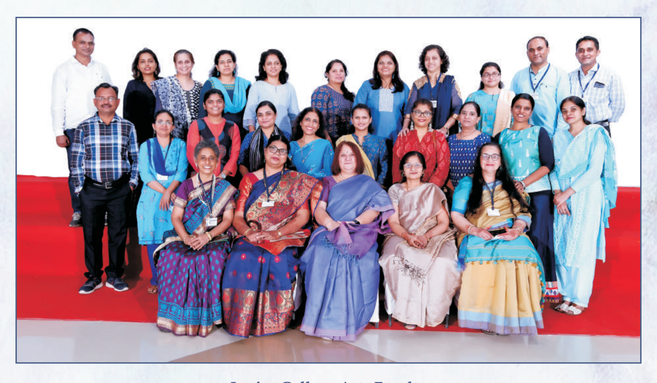
Junior College Arts Faculty