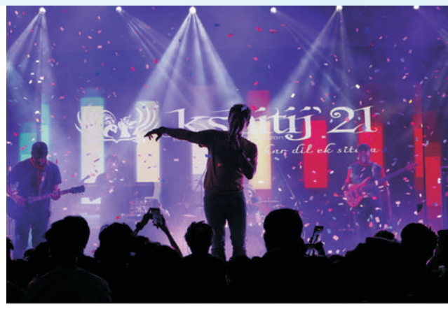
Bollywood singer KK performing live