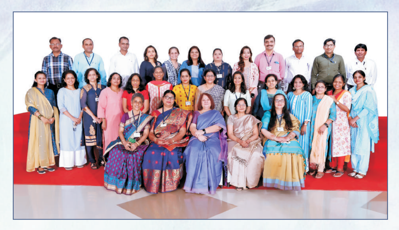
Junior College Commerce Faculty