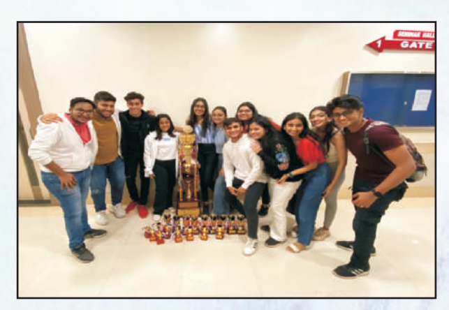
Overall Championship at Taarangan festival of Thakur College