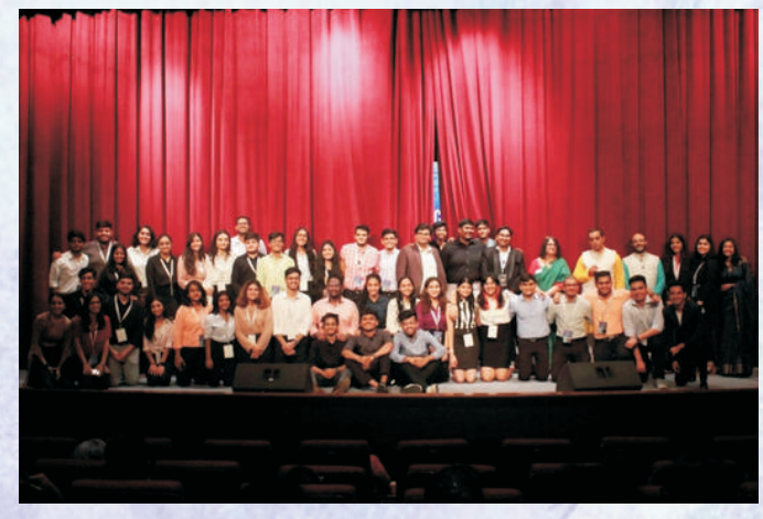
ADMIN TEAM OF MITHIBAI CULTURAL COMMITTEE 2021-22