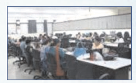
Staff Common Room