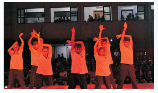
Street Dance Event