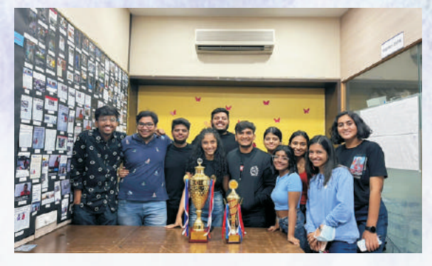
UMANG 2021 OVERALL 2nd RUNNERS UP