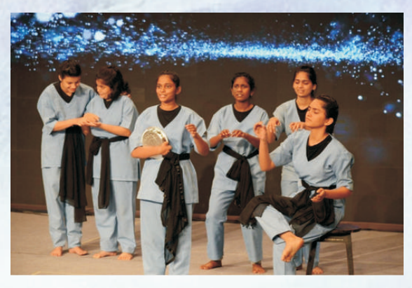
Marathi Skit performed at 60th Annual Day