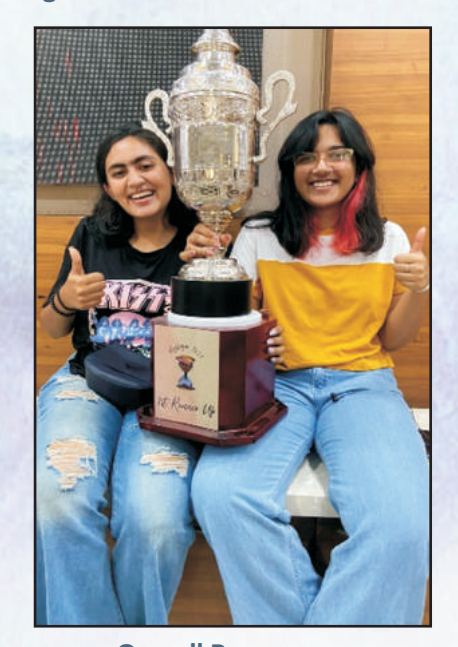
Overall Runners up Championship at Mystique festival of HR College