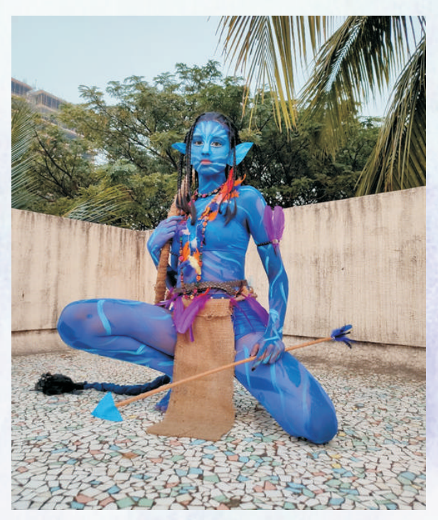
A Finalist at Cosplay event of IIT Bombay Mood Indigo festival