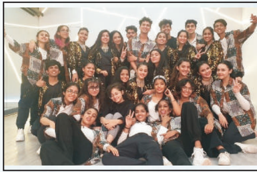
Mithibai Dance Team Secures 3rd Position in the Street dance event and Bollywood group dance event of IIT Bombay's "Mood Indigo 2022"