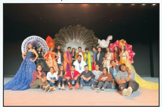
Mithibai Fashion Team Secures 1st Position in the Fashion show event of Asia's largest college fest "Mood Indigo 2022"