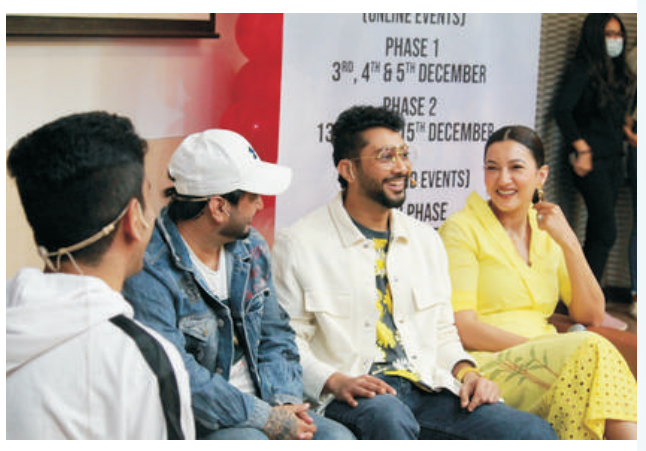
Song promotions with the social media stars-Gauahar Khan and Zaid Darbar