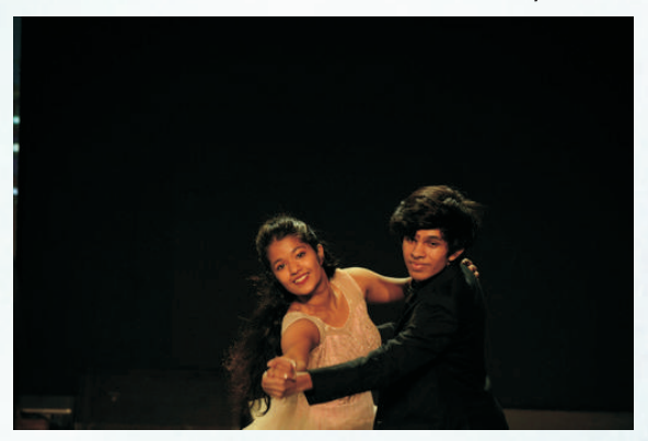
Fusion Dance performed at 60th Annual Day