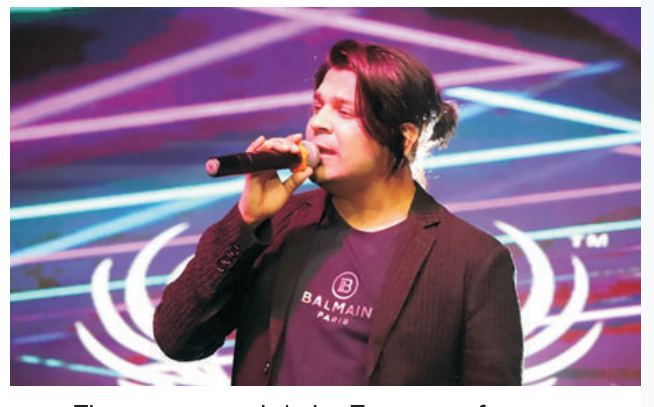
The sensational Ankit Tiwari performing live on day 2 of the festival