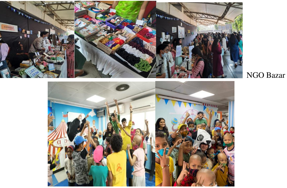
With Children at Tata Memorial Hospital

The ideology of the SVKM management of developing holistic individuals with a commitment of social consciousness is thus been taken ahead by the college